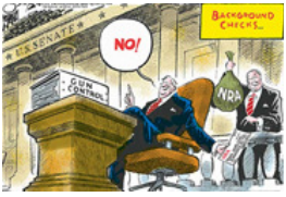
Gun Control Cartoons