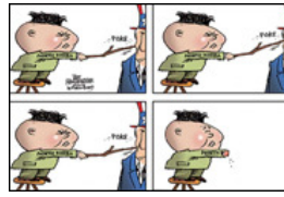
North Korea Cartoons