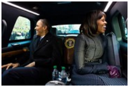
Obama Behind the Scenes